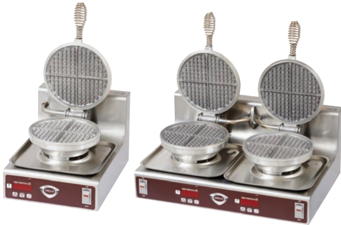
Models WB-1E & WB-2E

MODELS WB-1E - Single Baker WB-2E - Double Baker