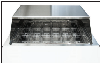
Removable cover with slide back lid

This product is equipped with a fine mesh filter to the front of the condenser to catch dust, and a rotating brush that moves up and down daily to remove excess buildup outward and away.